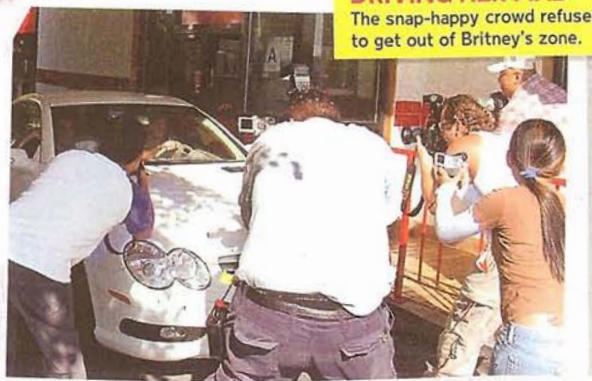
DRIVING HER MAD The snap-happy crowd refuses to get out of Britney's zone.