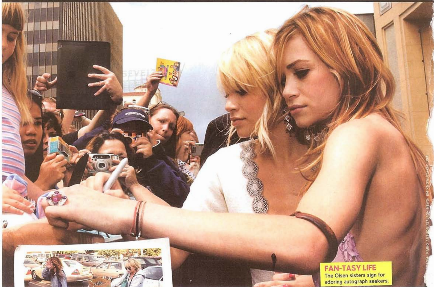
FAN-TASY LIFE The Olsen sisters sign for adoring autograph seekers.

Celebs like Mary-Kate and Ashley, Hilary and Lindsay are stalked by photographers 24/7, and their most private moments play out in public. Is life in the spotlight really all that great?