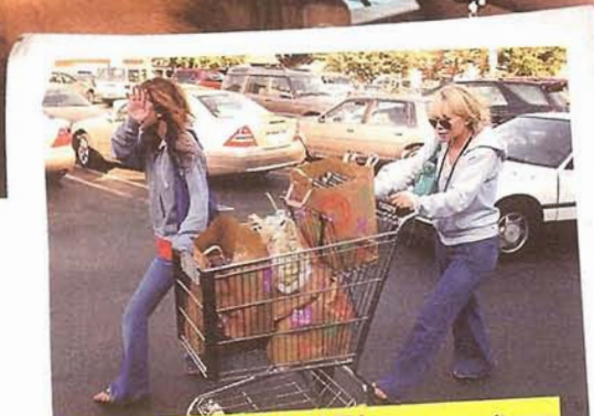
SUPERMARKET SNAFU The twins can't even stock up on snacks without photographers following!

SHE MISSED A FEW CLASSES. THAT'S WHEN THE RUMORS STARTED UP again. Could the star, who was treated at Utah's Cirque Lodge for anorexia last summer, be suffering a relapse? If so, had it been triggered by too many late nights partying at NYC hot spots—Butter, Bungalow 8 and Marquee? Nah. Like many college freshmen, Mary-Kate Olsen simply took a few days off. Only in M-K's case, the midsemester minivacation was a business trip for Dualstar, the $300 million company she runs with her