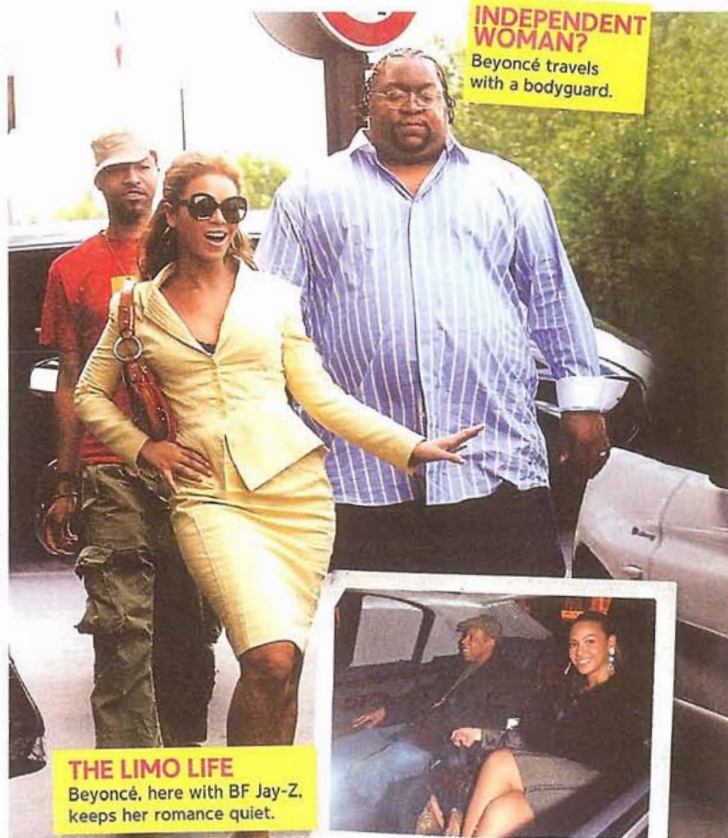
INDEPENDENT WOMAN? Beyoncé travels with a bodyguard.