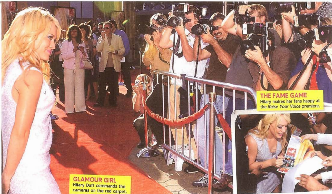
GLAMOUR GIRL Hilary Duff commands the cameras on the red carpet.