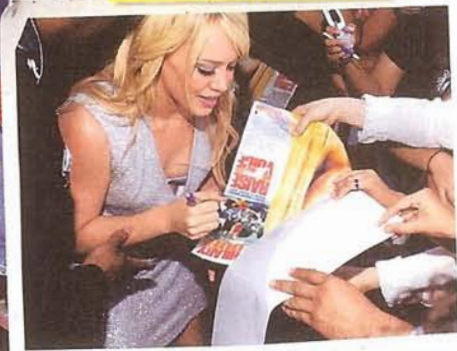
THE FAME GAME Hilary makes her fans happy at the Raise Your Voice premiere.

she's no doubt learning that if breaking up is hard to do, then a low-profile first date is next to impossible. Just ask Hilary Duff, who began hanging out with Good Charlotte's Joel Madden, then suffered the morning-after tabloid analysis. "We're good friends," says 17-year-old Hilary, denying any romance with the rock star. "It's so weird. I could go out with anybody, and somebody would say something about it. It's really hard."