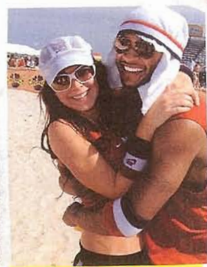
FAMOUS FRIENDS Being a star means you get to hang with hot guys like Usher!

twin sister, Ashley. But instead of reporting the truth, the tabloids ran with headlines screaming that the 18-year-old star had suffered a relapse.