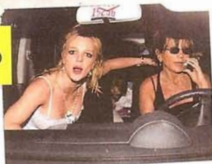
The pop star (with her mom) wants photogs to back off.

director of the Eating Disorder Center of California and the Monte Nido Treatment Center in Malibu.